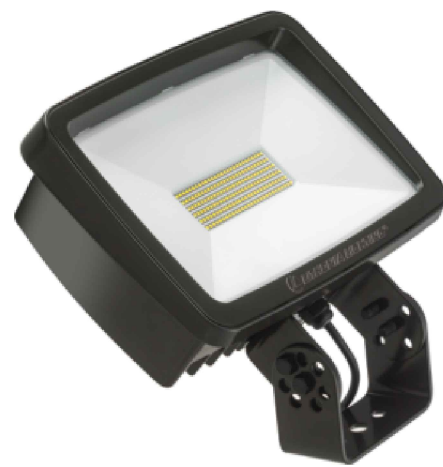
TFX2 with Yoke Mount